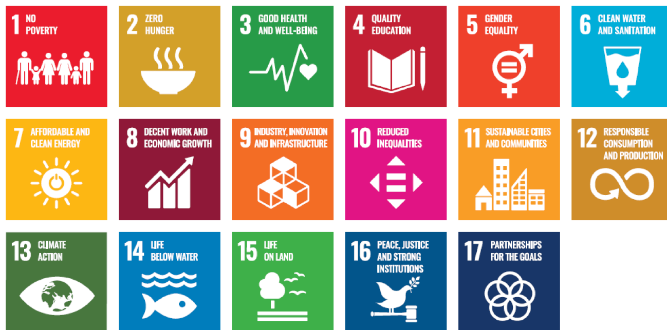
Figure 3 — The icons of the United Nations Sustainable Development Goals (SDG)